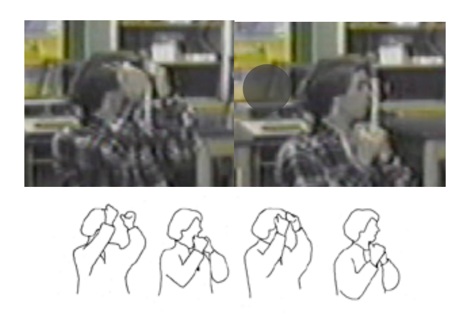
Fig. 4. S4: "The Earth has more pull on you."