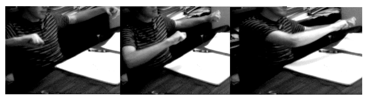
Figure 2 a, b, c. Extreme case comparison gestures for twisting a rod.

A hypothesis that explains the process underlying this extreme case is the following. Given the above observations, it is plausible to interpret this process as "imagery enhancement" (or "simulation enhancement")—that the role of this extreme case is to enhance the subject's ability to run or compare imagistic simulations with high confidence.