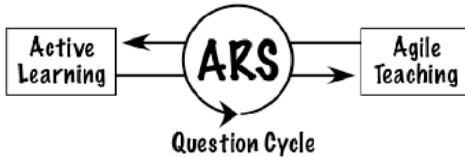
Figure 1: A representation of Question Driven Instruction.

Question Driven Instruction is a perspective, an instructional style, and a set of pedagogic techniques. It is founded upon the following beliefs.